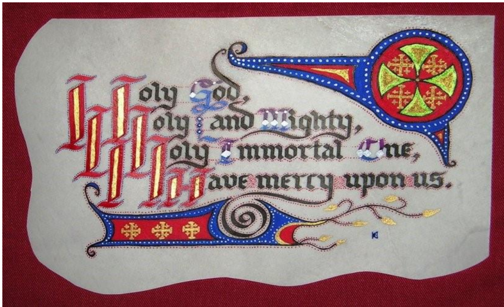
Trisagion – Hymn #707